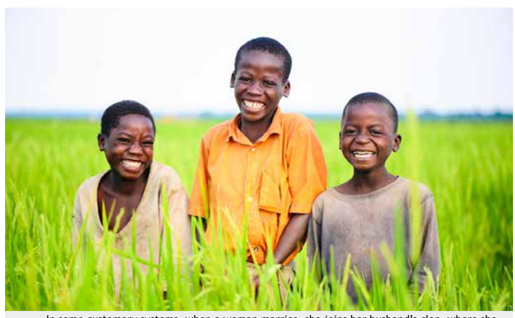
In some customary systems, when a woman marries, she joins her husband's clan, where she has rights to access and use land allocated to her husband. (Above) Children of rice farmers.

Because many customary tenure arrangements discriminate against women and have failed to protect women from losing their access to land, a number of activists in Uganda have argued for legal solutions that guarantee women the same