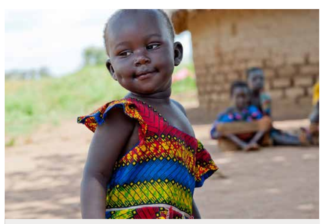
Uganda's formal law, including the Constitution, recognizes women's land rights and bans gender-based discrimination.

The Land Act also provides for the direct participation of women in various local land institutions. Specifically, it stipulates that at least one-third of the members of each District Land Board and each Communal Land Association (CLA) must be women. District Land Boards are established by the government to hold and allocate district land which is not claimed by any person or authority, and to facilitate the registration and transfer of interests in land. CLAs are groups of individuals who wish to assert communal ownership and management of land, whether under customary law or other tenure system. The District Land Registrar has the responsibility to approve every CLA constitution before it can be legally recognized.