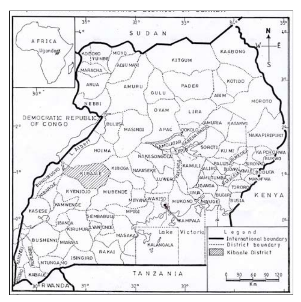
Map 7.1: Location of Kibaale district in Uganda

The ownership of mailo land in Buyaga and Bugangaizi counties by mostly Baganda was vehemently opposed by the Banyoro who considered themselves the original land owners. By the time of Uganda's independence in 1962, the contentions over land ownership in the two counties had not been resolved. Despite the 1964 referendum by which the people of Buyaga and Bugangaizi counties voted to be returned from Buganda to Bunyoro Kingdom, the central government did not resolve the contestation over the ownership of mailo land in the two counties.