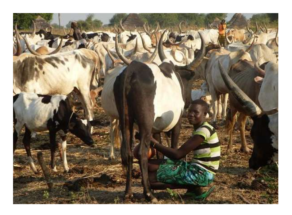
Women in cattle camp, Gogrial East County, Warrap State (2012).