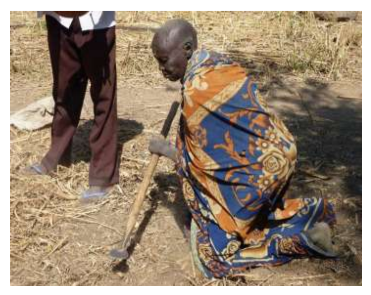
A 60-year-old widow demonstrating the use of traditional tools. 'I cultivate a bit of land and plant sorghum and sesame. It is very hard because I have only malodas and the food is not enough. I have to take care of my four grandchildren:<sup>94</sup>

In some of the communities visited, villagers were interested in expanding agricultural activities, but said that this had not been possible with the traditional tools they used. For instance, in Thuramon the majority of the people interviewed explained that they had only malodas (traditional hoes with a very small blade) or hoes to cultivate. In the communities in Cuiebet County in Lakes State, where Oxfam has distributed ox ploughs in addition to hoes and seeds, villagers expressed their appreciation and asked for more ox ploughs. <sup>93</sup>