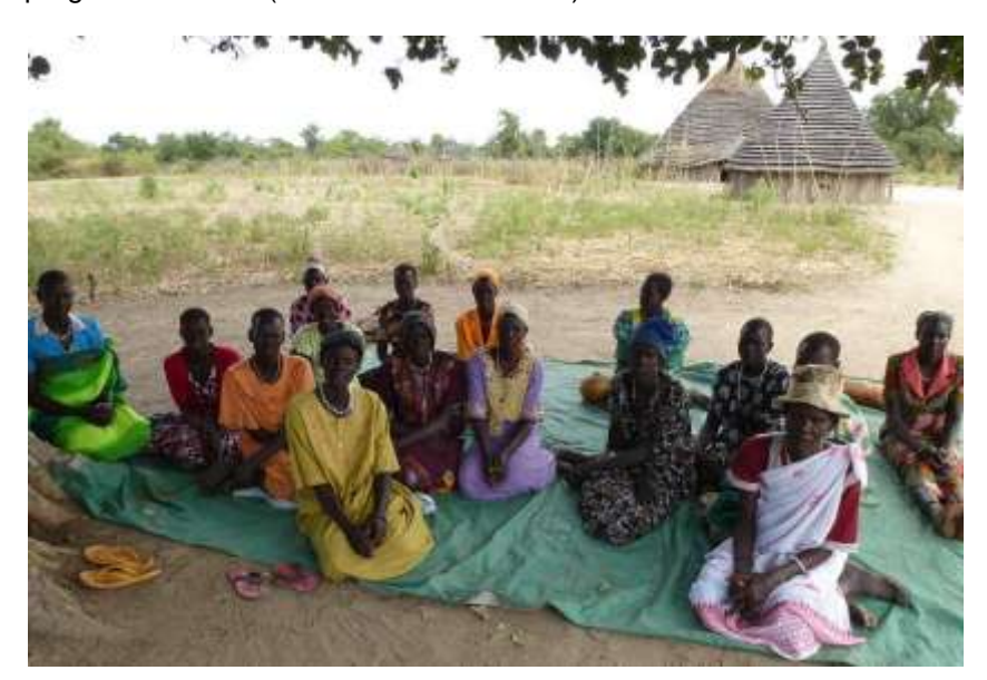
Focus group in Gogrial East County, Warrap State (November 2012).

Given the broad scope of the research – security, livelihoods, and gender justice – and the limited time available, it was not possible to undertake an in-depth study of all these areas. Also, while in some areas, especially security and conflict, there was much literature, in others – livelihoods and gender justice – there was less. In general, it was found that most of the reports focused on broader analysis and very little information was available from rural areas. Thus the research focused on communities in remote areas, to give voice to people who, although the most affected, are not listened to sufficiently. While individuals in the Oxfam teams were very helpful in providing information and support, the author had hoped for more input from the programme areas (livelihoods and WASH).