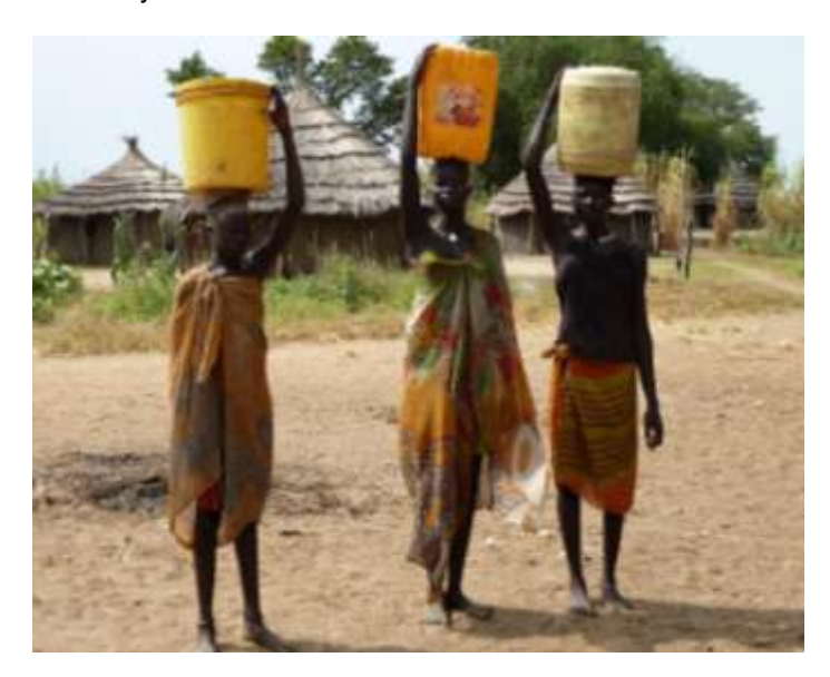
Women fetching water, Rumbeck County, Lakes State (October 2012).

In addition to concerns about their physical security, focus groups in the communities also raised a number of issues related to the absence of basic services. The main concerns included lack of water, lack of health care for both humans and animals, and food insecurity, followed by lack of access to education and feelings of isolation. These are summarised below; food insecurity is dealt with in section 3 on livelihoods.