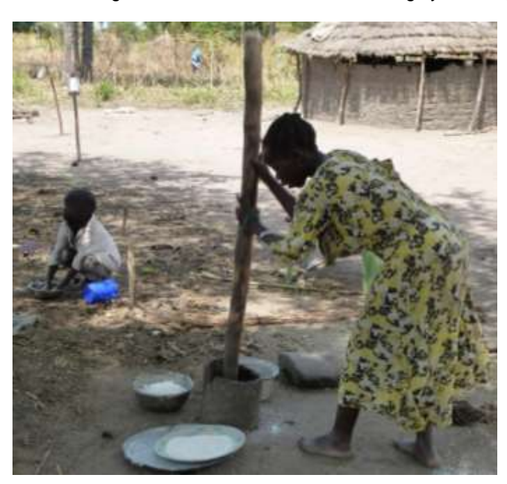
Woman pounding grain, Bhar Gel Cuiebet.

There have been some changes over recent years. Following the war, increasing urbanisation and the presence of international organisations have provided new livelihood opportunities for women in urban areas, which at times have enabled women to exert greater influence in the household. However, the situation of women, especially in rural areas where the vast majority live, including in the counties visited, remains largely unchanged.