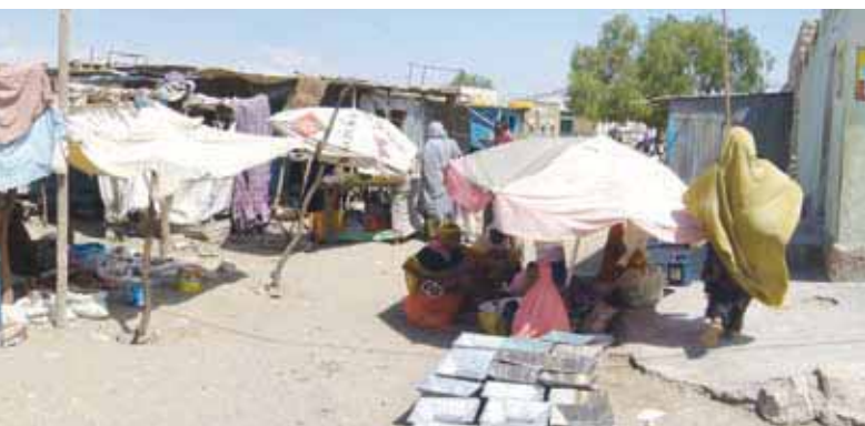
A Burao market scene.

Somaliland and Puntland have meanwhile seen significant economic growth and social development. The northern ports are crowded with outgoing livestock and imported consumer goods from Dubai. Enrolments in primary and secondary schools are growing steadily, and both Somaliland and Puntland have established several small universities. Taking advantage of the prevailing peace, 700,000 refugees have returned from exile to Somaliland, while 400,000 came back to Puntland.