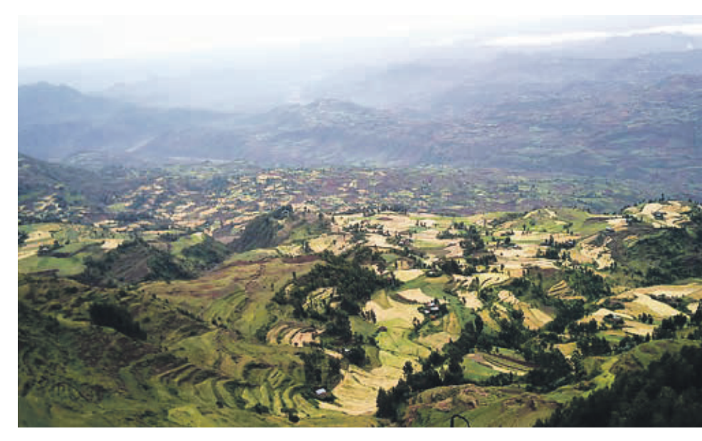
Agricultural production is constrained by fragmented plots of farm land due to population growth and growing encroachment of public and private investments.

which is very expensive. Since the land supplies low yields per hectare, many farmers try to take advantage of living near the mega-city of Addis Ababa. These farmers look to wage labour to subsidise their families' livelihoods. According to these farmers, many face the risk of crop failure as a result of unexpected rain because of inadequate extension services given by the office of agriculture, coupled with a general disregard for weather forecasts.