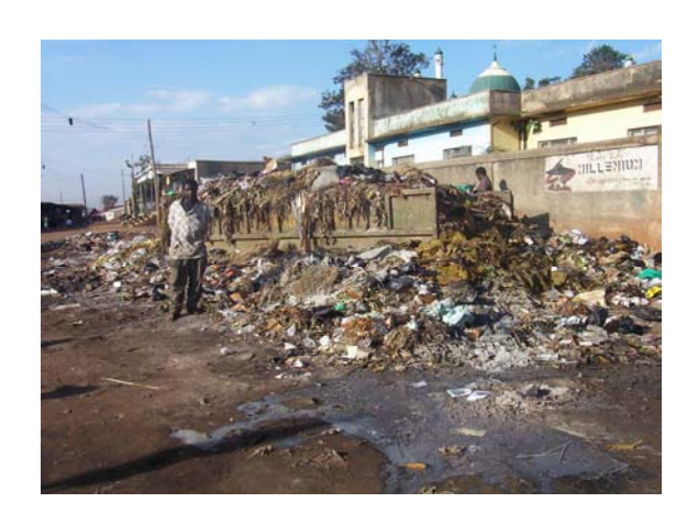
Plate 3: An overflowing City Council Skip in Wandegeya next to Makerere University 2004

Solid waste management is one of the serious problems in Kampala that has undermined the council's capacity for proper management and efficient disposal (KCC 1998). Kampala enjoyed the urban administration monopolistic statutory requirement of collection, storage and disposal of waste ((KCC 1995, Uganda 1964). With inadequate supply of skips and trucks, it has lead to accumulation and overflowing of garbage as well as emergence of illegal dumping sites (Plates 3and 4). Realizing the daunting challenge of keeping the city free of accumulating rotting garbage, KCC embarked on a policy reform to revise the solid waste management ordinances. In 2004, this ushered in private involvement in collection and transportation of wastes to the landfill. KCC is only remaining with disposal while collection and transportation is fully privatized and households pay between 10,000/= -15,000/= per month for door – to – door emptying of their waste storage facilities.