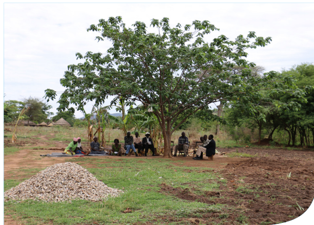
Discussion Group, Paimol Sub-County

The pilot phase of the project is being rolled out in 7 selected clans, one in each of the seven districts in Acholi Sub-Region. This includes Anaka in Nwoya, Paimol in Agago, Paicho in Gulu, Orom in Kitgum. Atiak in Amuru, Lapul in Pader and Madi-Opei in Lamwoo.