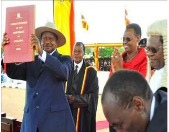
The President of the Republic of Uganda raises the Constitution of the Republic of Uganda

With the above regulatory framework, land is no longer viewed in terms of rights recognition only, but in terms of its productive capacity and as an enabler for economic empowerment and political participation.