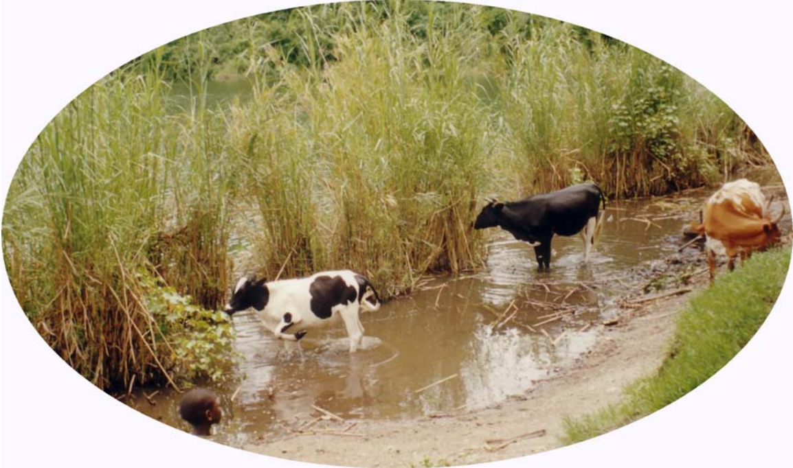
Figure 3. The photo shows a pool shared by humans for drinking and livestock.