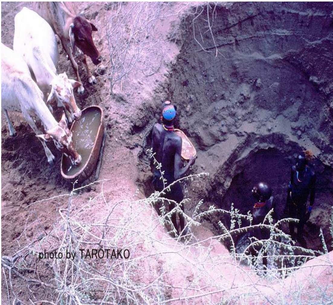
Figure 2. This Pokot warrior was captured fetching water from a laggah (riverbed) for the livestock during the dry season.

In 1995, the President of Uganda issued a directive that the Karamojong and other nomadic tribes should remain within their district boundaries and the emergency rehabilitation of valley dams was planned to facilitate this (Watson, 1997, p. 11). The aim was to mitigate the likelihood of clashes over water and grazing. For security purposes, it seems important to change the lifestyle of the communities and concentrate them as much as possible on agriculturally based farming, especially along the main rivers in the districts that have the potential for gravity irrigation.