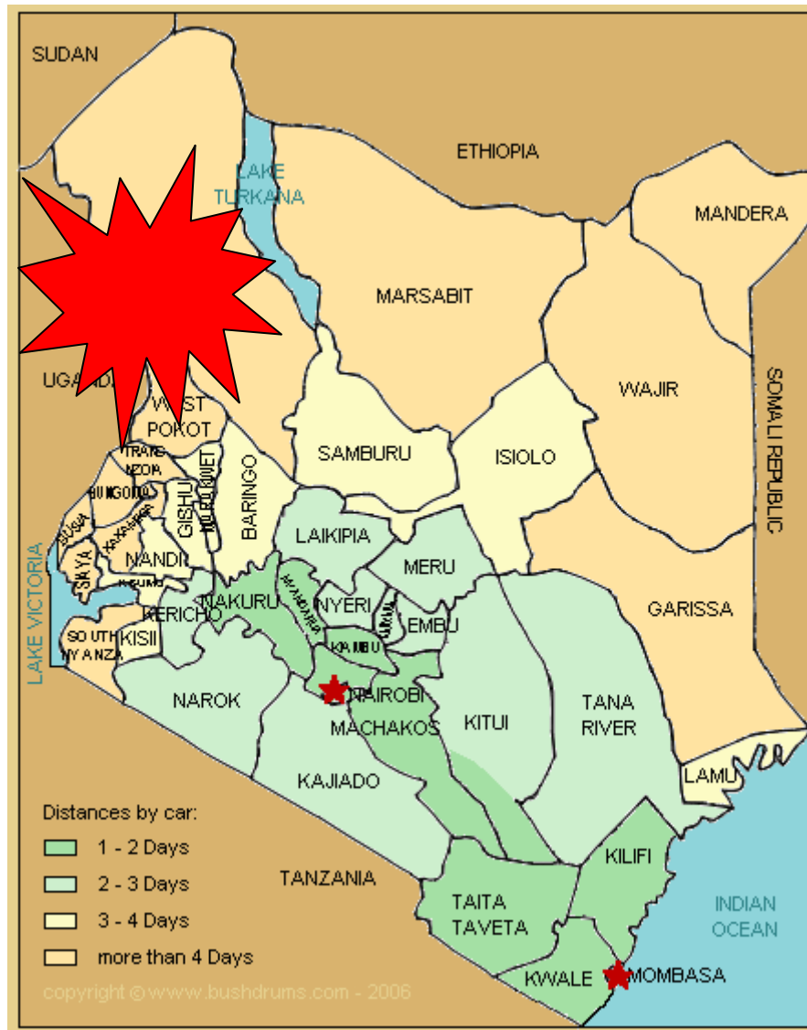
Figure 5. Map of Kenya and Uganda showing the area of study.

Turkana District has been described as an inhospitable environment, since it is dry and hot year round (McCabe and Ellis, 1987). Its area is 77,000 sq km with a population of over 340,000 people. Lying within the Great East African Rift Valley, the district is bordered by chains of ridges and mountains to the west towards Uganda. In the east is Lake Turkana. The Pokot, Rendille and Samburu of Kenya live to the south. Predatory raids on livestock are a common means of survival. However, the Turkana have been