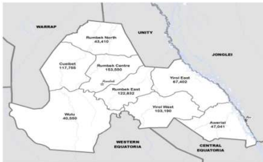
3.1 Map of Lakes State, South Sudan 1

This study was conducted in Yirol East and Wulu Counties, Lakes State, South Sudan (see figure 3.1)