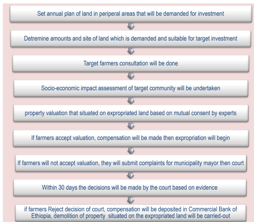
Figure 2: The General and Standardized procedures during land expropriation in Amhara regional state.

According to (FDRE Proclamation No. 455/2005, 2005), art 9 [11], the valuation of property situated on land to be expropriated shall be carried out by certified private or public institutions or individual consultants on the basis of valuation formula adopted at the national level. Art. 10 of this proclamation suggested that property which is available on the land will be valued by committees. Where the land to be expropriated is located in a rural area, the property situated thereon shall be valued by a committee of not more than five experts having the relevant qualification and to be designated by the woreda administration (sub-art. 1). This proclamation also suggests valuation of property which is situated on the expropriated land will be done by experts who have a duty in each urban area. This proclamation also support and determine the qualification of experts. Accordingly, experts have at least related educational qualification of background of urban planning, cost management and property valuation.